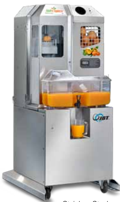
Stainless Steel Model

JBT extractors currently process over 75% of citrus juices produced worldwide.